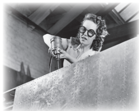
During WWII, thousands of "Rosie the Riveters" enrolled at Trade Tech, lending their skills to support the war effort.

The advent of World War II created an exponential demand for the college's training programs in support of the war effort. The college's Aircraft and Welding Trades departments operated directly under the supervision of the federal War Production Training Program, while the majority of other programs were quickly reformatted to provide short-term training of six to ten weeks in duration, often at war production plants located throughout the city.